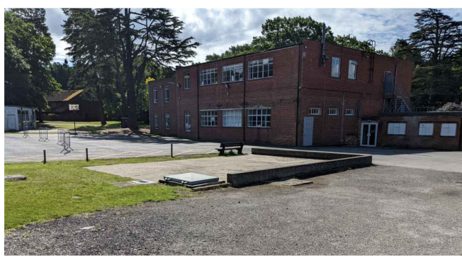
Service Area 7 - low wall to be demolished.

Existing building areas to be demolished.